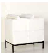
54 03 26PExx

colli 1 : 99x62x13H cm - 24,80 kg colli 2 : 67x51x12H cm - 34,60 kg colli 3 : 56x23x14H cm - 2,80 kg colli 4 : 89x6x3H cm - 2,50 kg Gross weight : 64,70 kg Net weight : 60,00 kg Cbm : 0,141