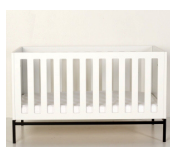
54 01 35PXLxx

colli 1 : 125x69x8H cm - 21,00 kg colli 2 : 70x69x6H cm - 17,60 kg colli 3 : 66x23x4H cm - 3,10 kg colli 4 : 121x 6x3H cm - 3,40 kg Gross weight : 45,90 kg Netweight : 41,00 kg Cbm : 0,121