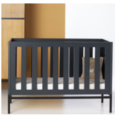
54 01 35Pxx